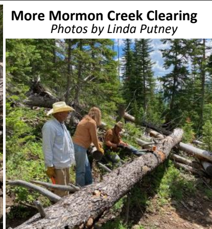
More Mormon Creek Clearing